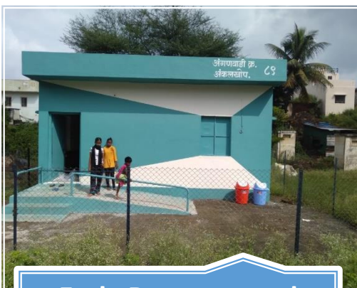
Early Recovery and Immediate response in flood

6. Preparation of peoples Biodiversity register: Prerana foundation prepared People biodiversity register of 75 villages of Walwa block Sangli. Prerana foundation created awareness at village level regarding conservation of natural resources and sustainability of it.