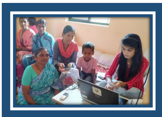
Shirala block, Sangli District.

Neharu Yuva Kendra has supported Prerana foundation Yedenipani for creating awareness campaign for covid 19 safety, with the help of Neharu Yuva Kendra prerana foundation have distributed masks and sanitisers to 40 beneficiaries of Yedenipani village from Walwa block, Sangli.