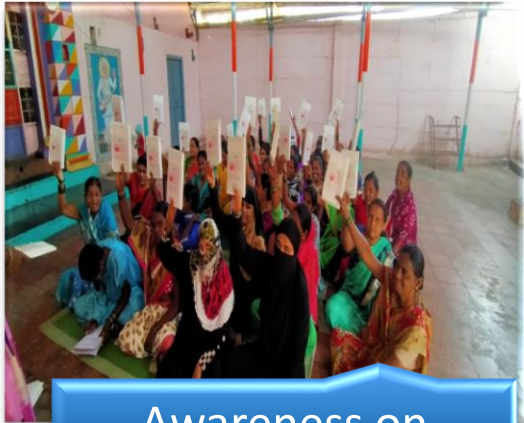
Awareness on menstrual Hygiene

5. Awareness on Menstrual Hygiene: women still face menstrual hygiene health issues in Sangli District. So, looking for this concern, Goonj, Mumbai and Seva Sahyog, Pune supported for Awareness on Menstrual hygiene and distribution of 567 sanitary pads to needy.