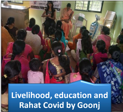
Livelihood, education and Rahat Covid by Goonj