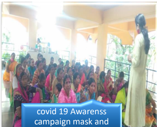
covid 19 Awareness campaign mask and sanitiser distribution

Prerana Foundation has channelized rural livelihood issues with Goonj Mumbai through generating “Cloth for work and school to school” activity for poor and needy people. Everyone is becoming fearful due to this most transmitted pandemic Covid 19, so, many rural families suddenly lost their livelihood. For being survival in this situation, Goonj, Mumbai and Prerana Foundation has provided sanitary pads, Food Material and health kit for 180 beneficiaries at Walwa block.