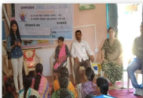
Capacity Building and Skill development

Prerana Foundation strongly believes in capacity building and skill development of rural youth for livelihood generation. With this moto Prerana foundation has collaboratively worked with Khanvali Grampanchayat Lanja block, Ratrnagiri and Ghabakwadi Grampanchayat of Walwa block, sangli District. It is beneficial for 94 female beneficiaries.