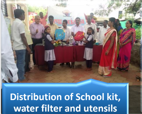
Distribution of School kit, water filter and utensils

on this issue and started sensitizing on skills and knowledge about financial literacy with SEBI, Mumbai, it benefits 520 beneficiaries from 15 villages of Walwa block and Shirala block, Sangli District from 20 trainings