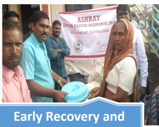
Early Recovery and Immediate response in flood

6. Preparation of peoples Biodiversity register: Prerana foundation started working on preparing People biodiversity register of 75 villages of Walwa block Sangli. Prerana foundation started creating awareness at village level regarding conservation of natural resources and sustainability of it.