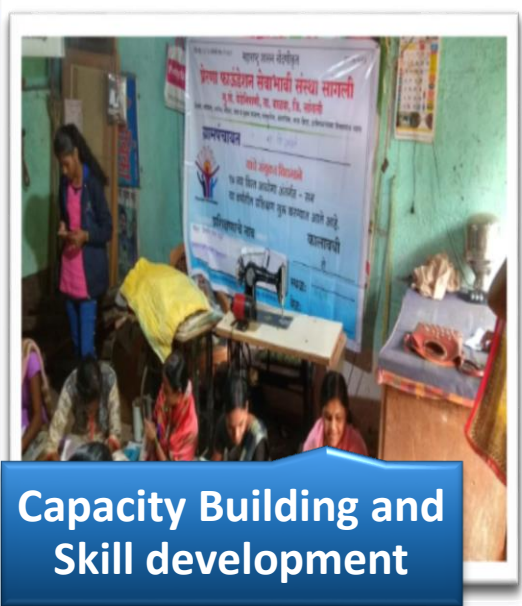
Capacity Building and Skill development

Prerana Foundation identified rural issues in that lack of skills, knowledge and capacity is major reason to set back rural community towards underprivileged lifestyle. So, we focus towards capacity building and skill development of rural youth for livelihood generation. With this moto Prerana foundation has collaboratively worked with many grampanchayats like Kondaiwadi and Pandharewadi Grampanchayat shirala block, Sangli and Bilul Grampanchayat of Jat block, Sangli District. It is beneficial for 250 beneficiaries.