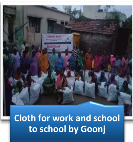
Cloth for work and school to school by Goonj

Prerana Foundation identified rural issues in that lack of skills, knowledge and capacity is major reason to set back rural community towards underprivileged lifestyle. So, we focus towards capacity building and skill development of rural youth for livelihood generation. With this moto Prerana foundation has collaboratively worked with many grampanchayats like Kondaiwadi and Pandharewadi Grampanchayat shirala block, Sangli and Bilul Grampanchayat of Jat block, Sangli District. It is beneficial for 250 beneficiaries.