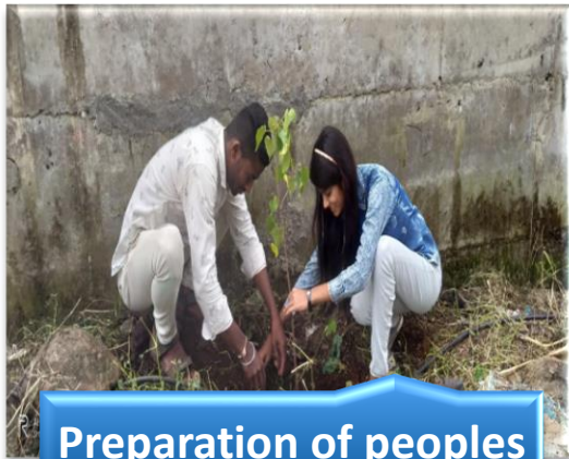
Preparation of peoples Biodiversity register

5. Distribution of School kit, water filter and utensils: due to severity of flood, many anganwadis damaged and all-important anganwadis material destroyed in flood, So, Seva Sahyog, Pune supported Prerana Foundation for building anganwadis with material support and school kit distribution to needy students. It's distributed at 64 anganwadis.